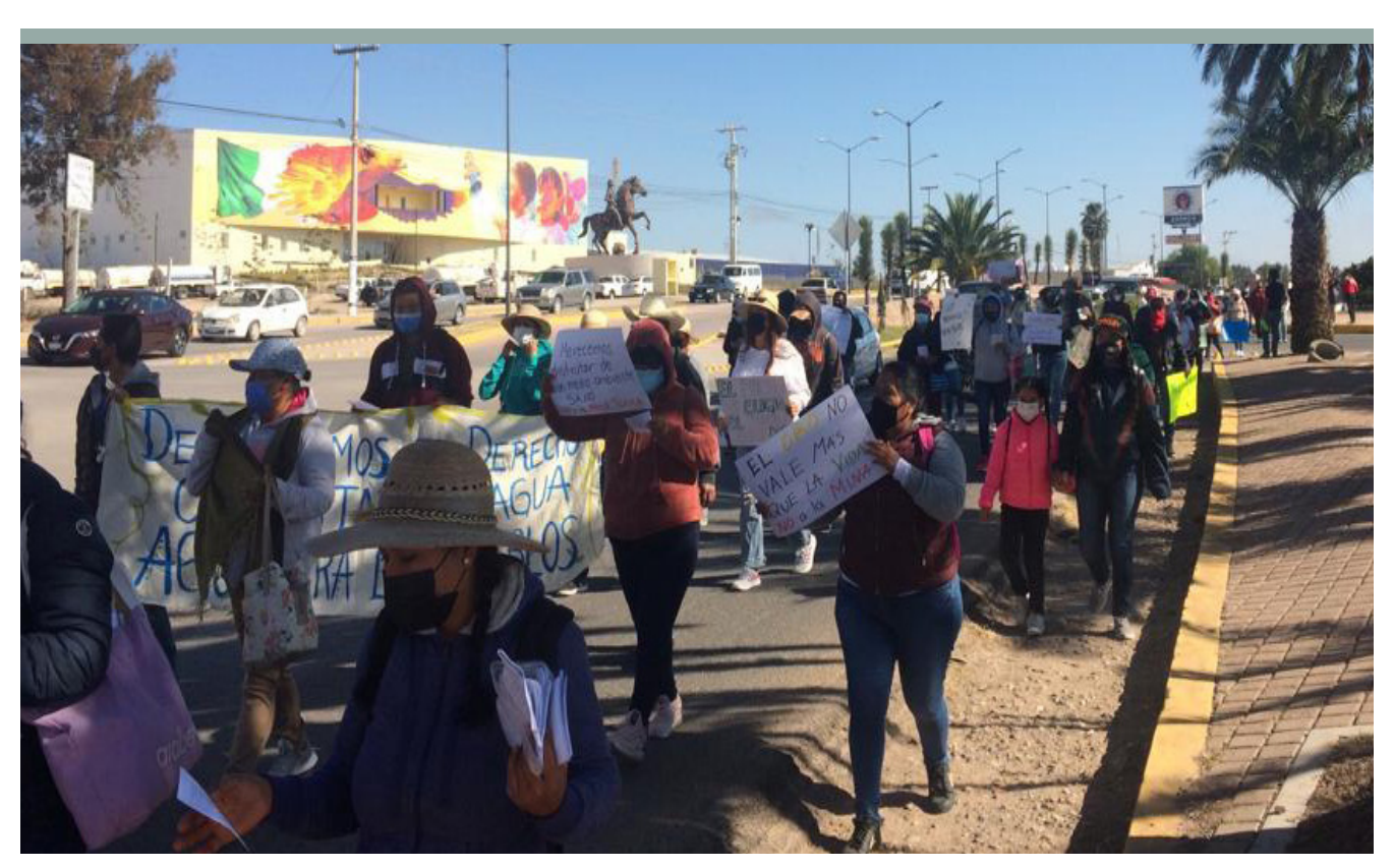
Photo: Protest against the Cerro de Gallo gold project in Guanajuato, Mexico in November 2021.

Even as the pandemic continues to rage, many land defenders have felt obliged to return to the streets, resume meetings, and continue exercising their right to self-determination – taking on considerable risk to their lives both from the virus and from violent repression. Despite the numerous threats, the interrelated crises have reinforced the importance of their struggle to keep fighting for clean water, air and land. Ultimately, one cannot "stay at home" if this means losing your territory, your water, your livelihood and your means of subsistence.