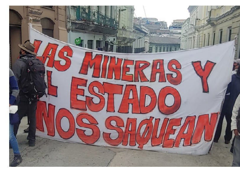
Photo: Protest in Quito against Mining Decree 151, October 2021. Banner reads: "Mining companies and the state loot us."

It was not only the people who arrived, but also a couple of military trucks turned up and passed through the crowd, they intervened in our protest and one soldier gets out. He approaches the stage, takes out his gun, leaves it on top of one of the speakers that