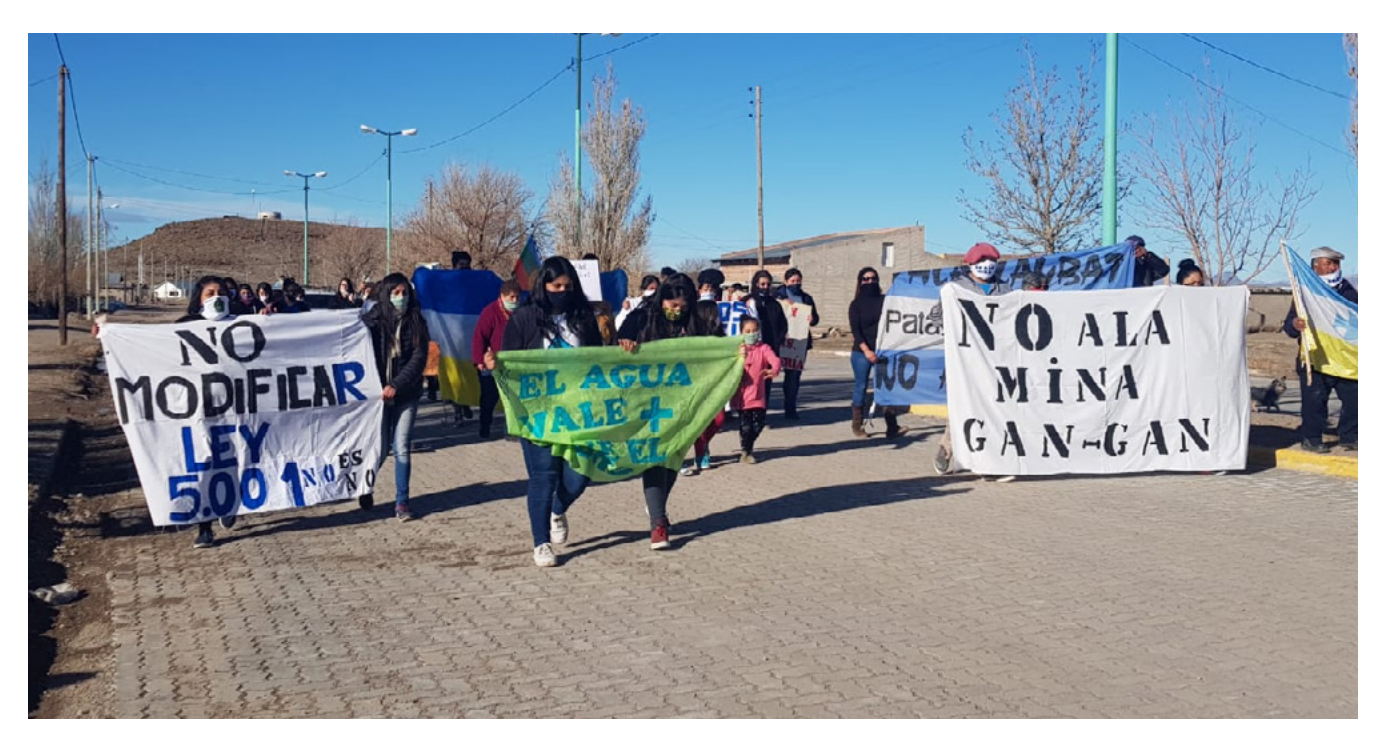
Photo: March in the Mapuche Tehuelche community of Gan Gan in the meseta (plateau) of Chubut, Argentina on August 4, 2020.

Furthermore, on December 15, 2021 the mining lobby succeeded after several attempts to get the legislature to approve a Zoning Law, which would allow open-pit mining in the departments of Gastre and Telsen, on the Chubut plateau (MiningWatch Canada, 2021). The vote took place in a surprise session, and ignored citizen demands by allowing open pit mining in the region. With this zoning they intend to create a precedent that would undermine the general prohibition of mining at the provincial level. However this was quickly repealed after massive protests by citizens. The protests had national repercussions and increased local tensions and repression targeted against members of the Union of Community Assemblies of Chubut (UACCh) and the Mapuche-Tehuelche people who are mobilizing against the bill (see section 2.1). Once again citizens were on the streets demonstrating their discontent and indignation, in the face of police repression (MiningWatch Canada, 2021).