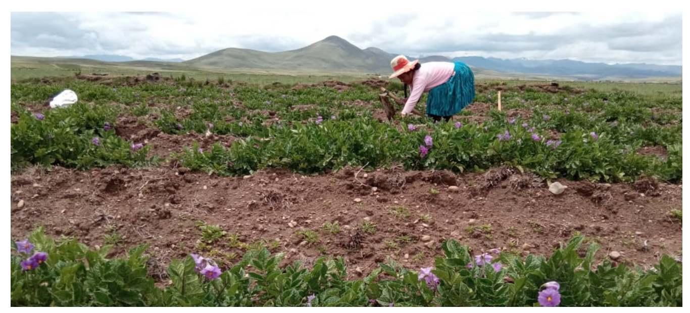
Photo: Women members of the Asociación de Mujeres defensoras del Territorio y la Cultura K´ana harvesting potatoes in Espinar, Peru. Credit: Elsa Merma Ccahua