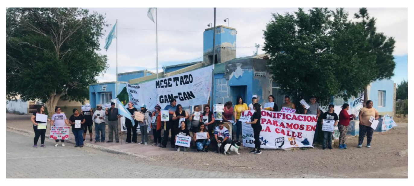
Photo: A protest led by the Mapuche Tehuelche community of Laguna Fría-Chacay Oeste in Chubut, Argentina, against the temporary approval of a law to re-zone the province to allow for mining. December 2021.

61 Personal communication, 22 July 2021.