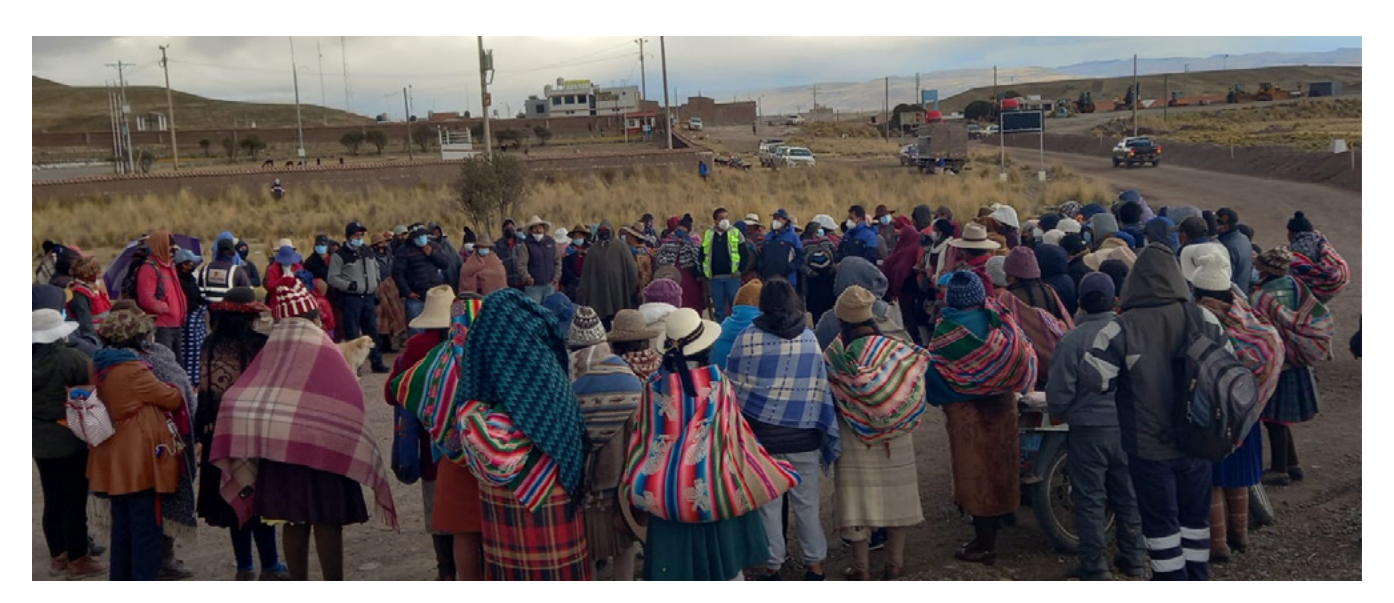
Photo: Protest of 11 communities affected by irregularities in the consultation over the Coroccohuayco project, an expansion of the the Antapaccay mine.