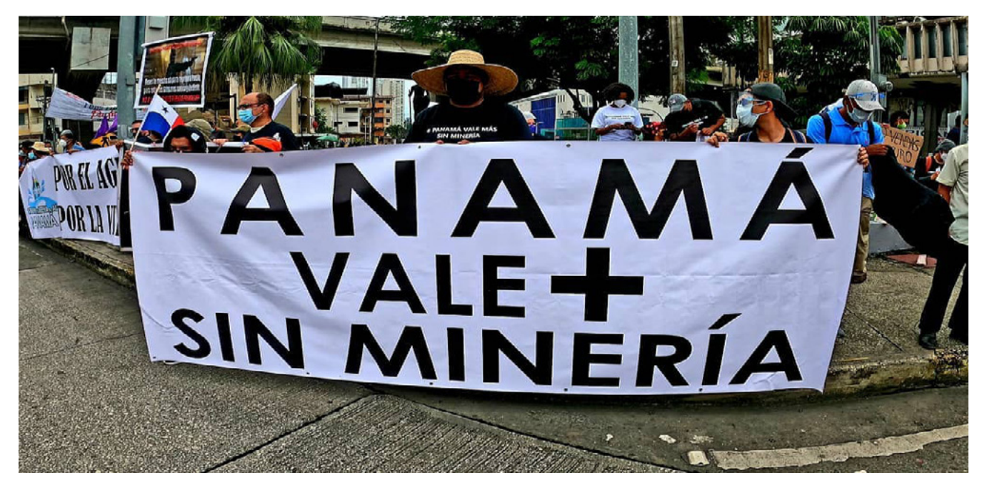
Photo: Protest led by the "Panama is Worth More Without Mining" Movement (MPVMSM) in Panama City.