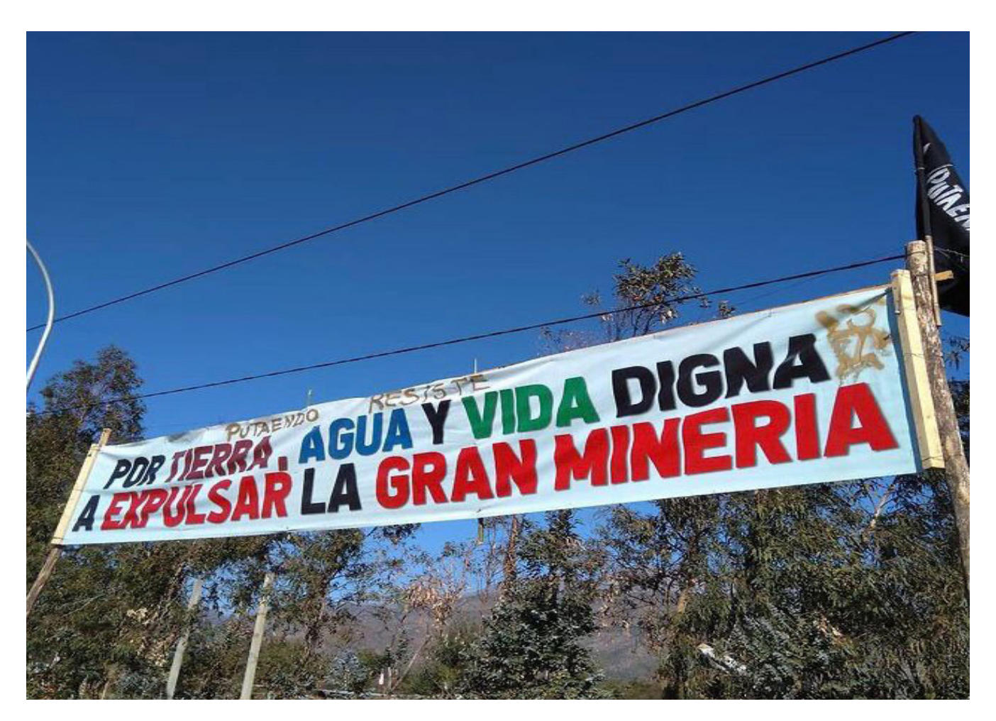
Photo: One of many banners around the community of Putaendo, Chile. It reads "Putaendo in Resistance: Expel Industrial Mining in favour of Land, Water and Life with Dignity".

the sanitary equipment... [is] already quite cheap... [these donations were] only for photo opportunities, in truth they only have one photo with a group of traders who agreed to take photos with them. [The company] is trying to take advantage of the needs and hardship of the people in its favor and to appear to be very well connected with the local people... and that they are good neighbors.