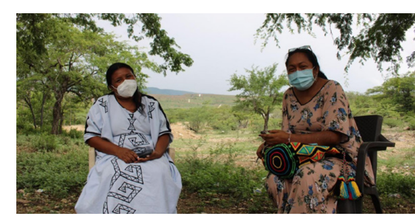
Photo: Members of the Fuerza de Mujeres Wayuu.

[...] that is why we too, because we are organized, we have also obtained packages of supplies or payments, or support with seeds. This is the result of our constant struggle. We always have to take care of our seeds, of our food sovereignty, as caretakers of our bodies and territories.<sup>66</sup>