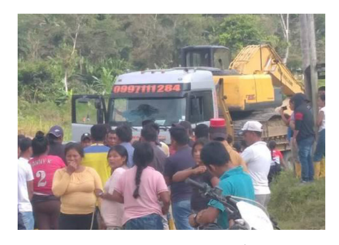
Photo: An attempt by Solaris Resources to forcibly bring in machinery to the community of Maikiuants in Ecuador, in August 2021.

In contrast no measures have been taken to lower the levels of subjugation, extortion, forced displacement and violence against the communities that inhabit these same areas - such as the community of El Bajío, which neighbours the La Herradura mine, where the Penmont company from the same business group operated illegally until 2013. In addition, between 2020 and 2021 there were significant cuts in the budget of government entities responsible for environmental protection (De La Rosa, 2021); two environmental bodies were eliminated altogether (Laureles, 2021), and a State trust fund with resources for the protection of human rights and environmental defenders was removed (Artículo 19, 2020).