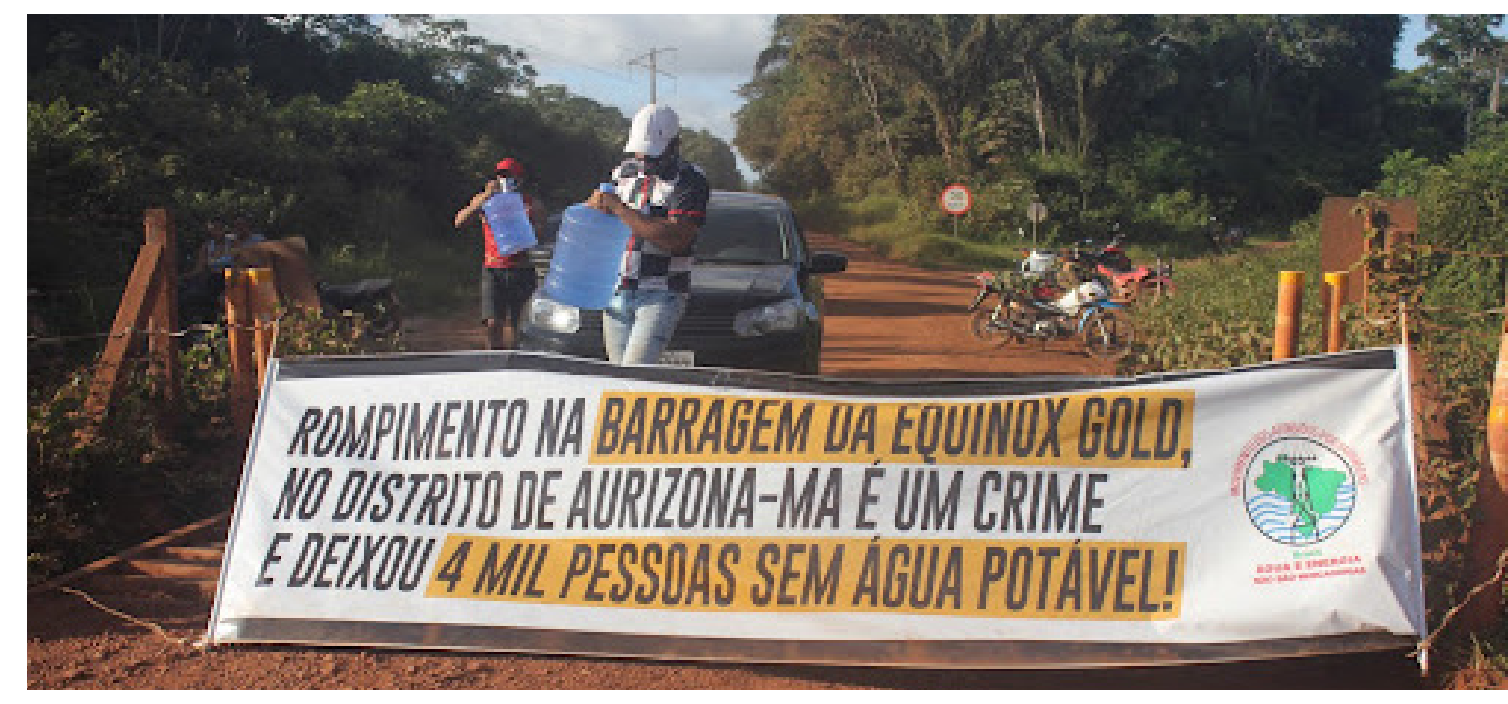
Photo: Protest banner in Aurizona, Maranhão, Brazil. It reads: "The rupture of Equinox Gold's dam in Aurizona is a crime that left 4,000 people without access to water."