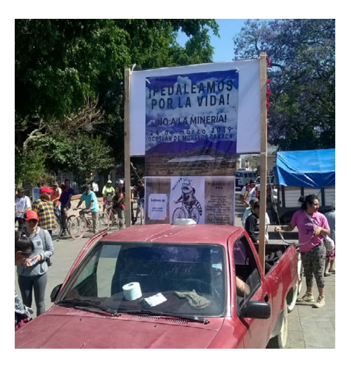
Photo: A bicycle protest against mining.

[...] there you have it, one of the great strengths that our movement has had is that we are working a priori, before the damage is done, before people start getting sick.<sup>62</sup>