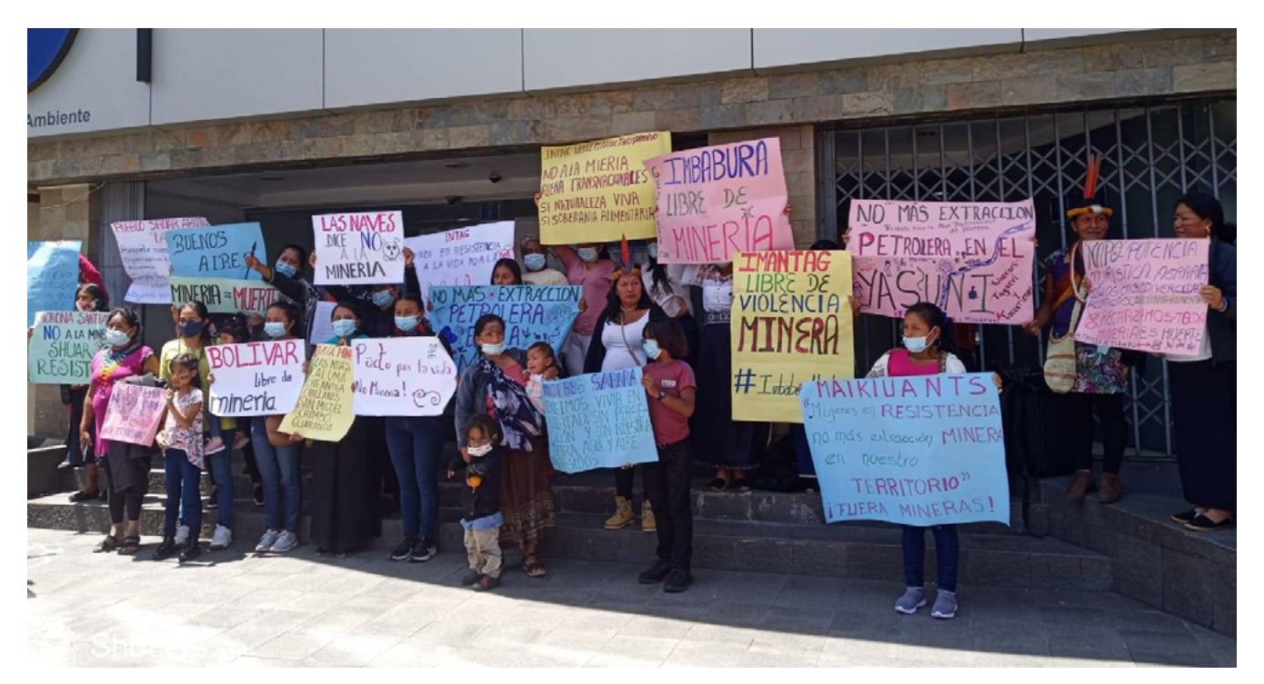
Photo: Demonstration in front of the Ministry of the Environment in Ecuador. October 2021.