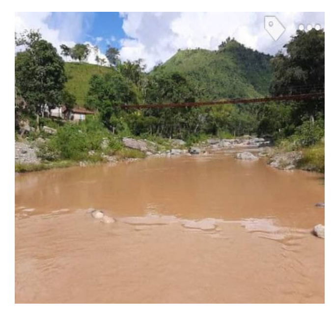
Photos: Contamination of the Rio San Pedro, before and after. Credit: Guapinol Resiste