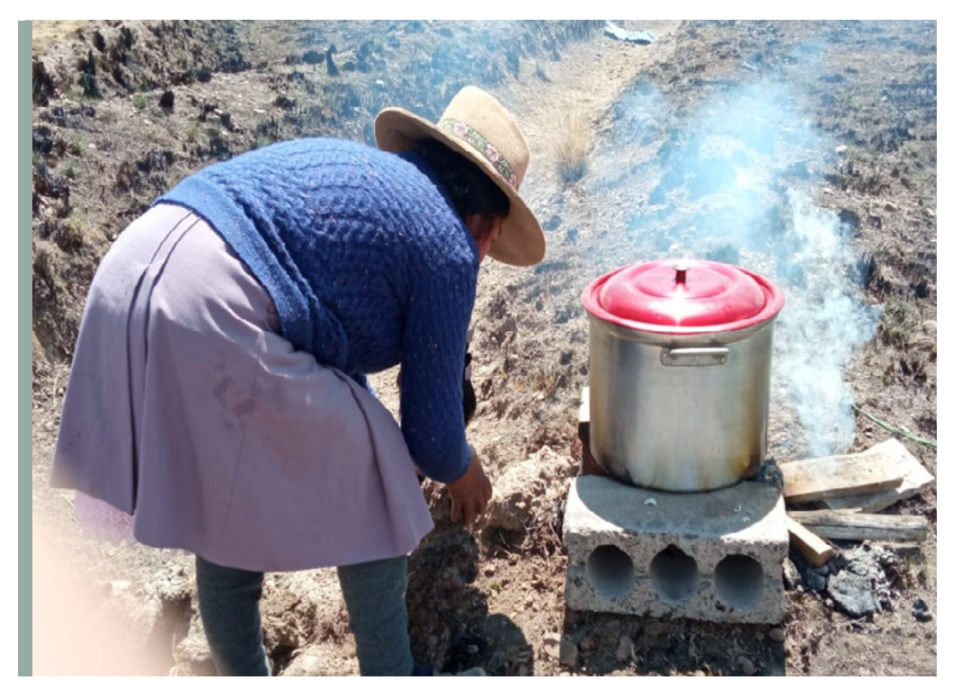
Photo: Planting seed potatoes in the province of Espinar, Peru.